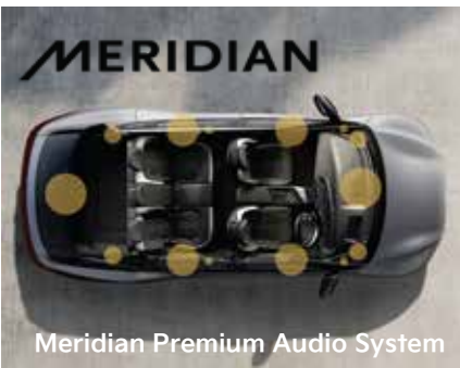
Meridian Premium Audio System