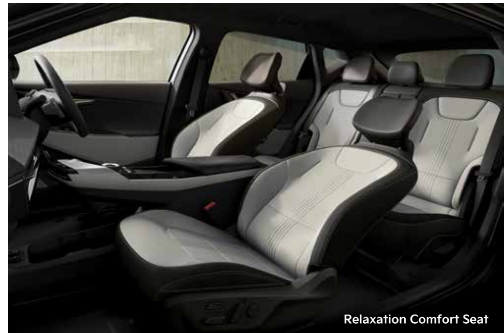
Relaxation Comfort Seat