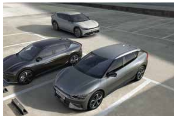
Rear Cross Traffic Collision Avoidance Assist