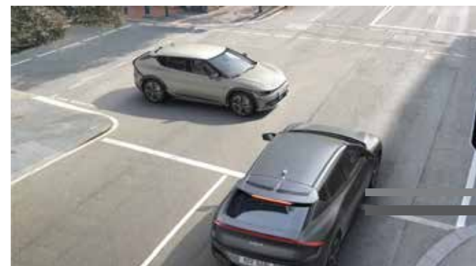
Forward Collision Avoidance Assist