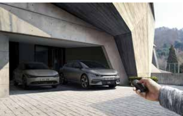
Remote Smart Parking Assist