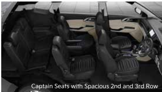
Captain Seats with Spacious 2nd and 3rd Row