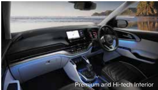
Premium and Hi-tech Interior