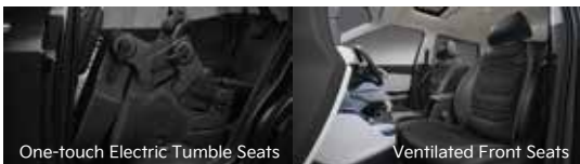
One-touch Electric Tumble Seats